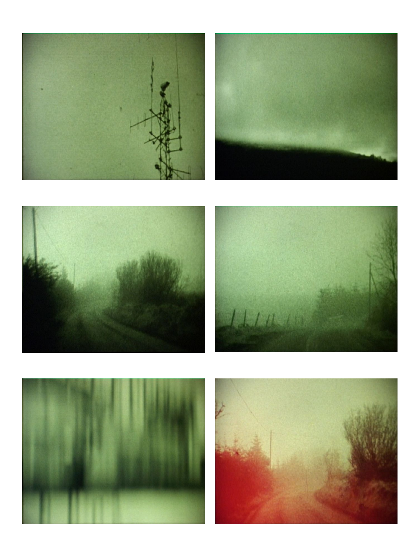
Still from Are We There Yet?