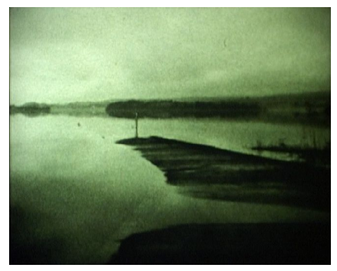
Still from Are We There Yet?