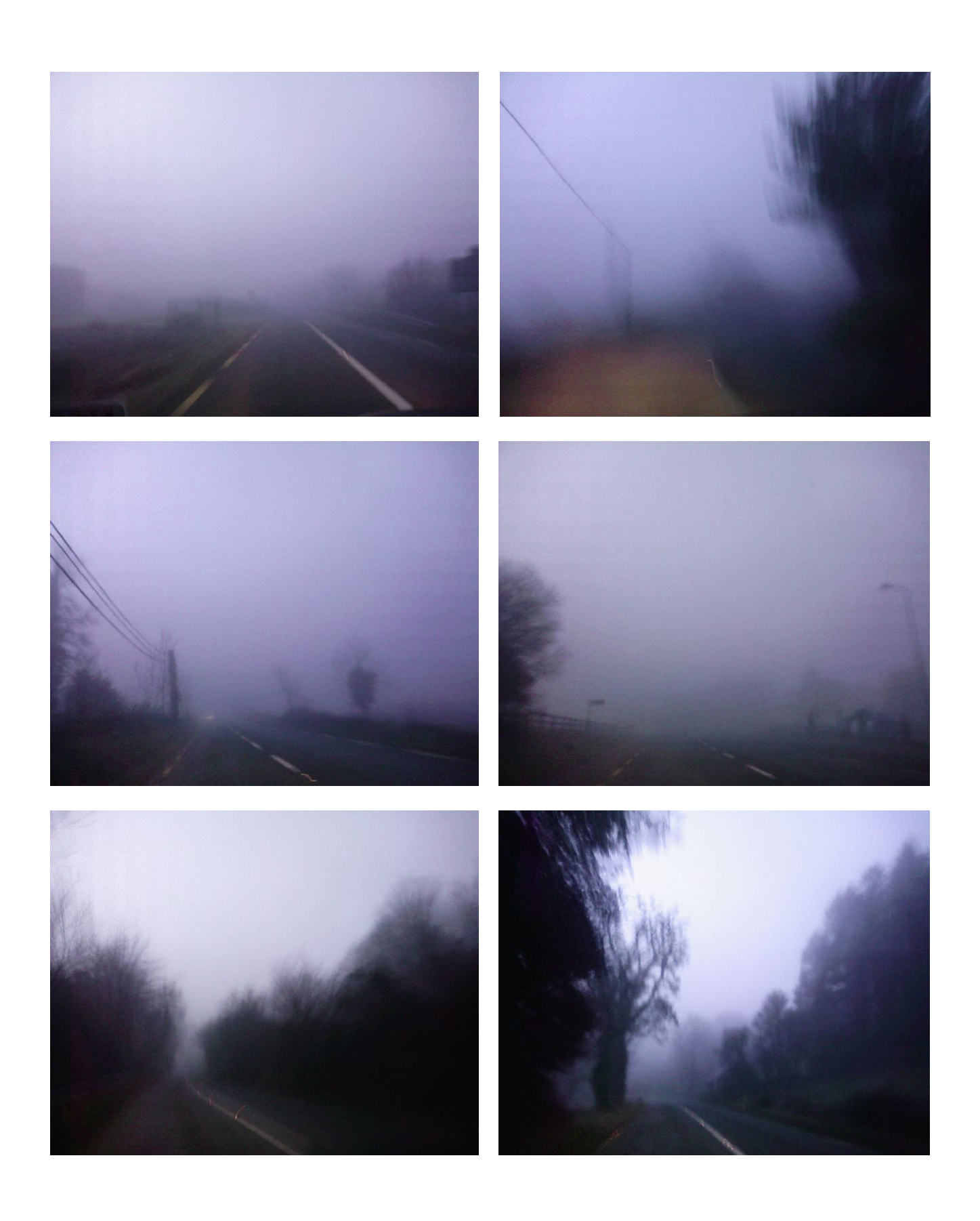
Excerpts from the series 32 photographs from the Leitrim-Fermanagh border